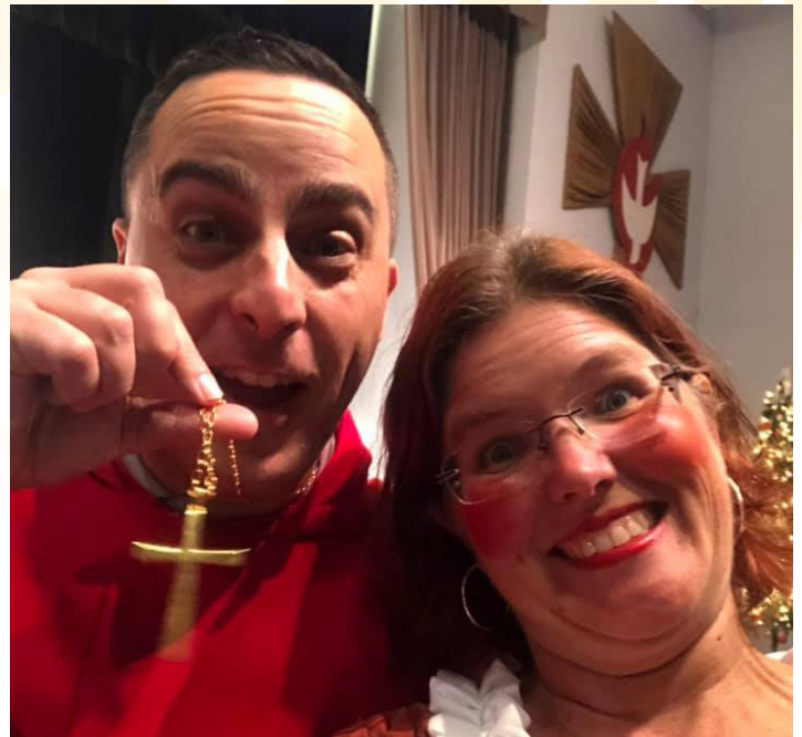
Madrigal dinner, 2019

And my goodness have we been through a lot these past eight years! I'd barely just arrived when the senior pastor I was called to work with here at Immanuel announced his retirement about six months later, and I was faced with deciding whether to leave or pivot my role from focusing on adult education ministries to holding things together for the next eighteen months or so during the interim process. I don't regret staying instead of leaving as I do believe I wound up being the stability