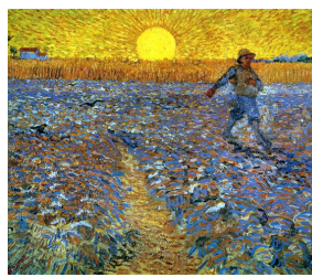
VAN GOUGH'S "THE SOWER"

What is the kingdom? Henri explains, “The kingdom is where God provides for all that we need. It is the realm of sufficiency where we are no longer pulled here and there by anxiety of having enough.” So counter-cultural, where worth is often defined by money and class, and self-reliance is valued above all else.