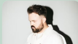
Cody Carnes Hollywood Stage