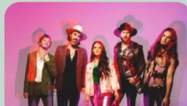
We The Kingdom Music Plaza Stage