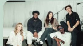
ELEVATION RHYTHM Hollywood Stage