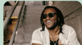
Blessing Offor Music Plaza Stage